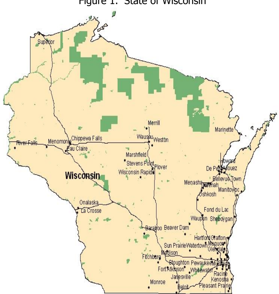
Figure 1. State of Wisconsin

This report presents estimates of the impacts of building 1,000 single-family homes in the State of Wisconsin (Figure 1).